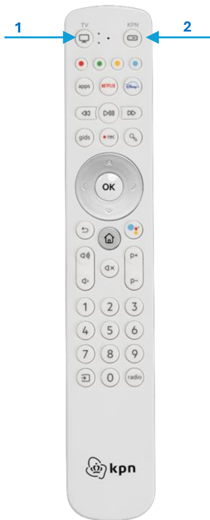
Figure 2 TV-Remote control

The start and final positions are programmed, so you don't have to do anything else.